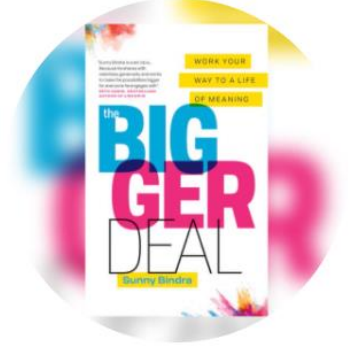
HReads The Bigger Deal