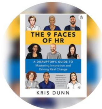
HReads The 9 Faces of HR