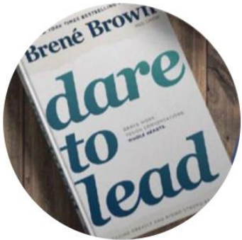
HReads Dare to Lead

1 club - 4 book groups (for manageableness and variety)